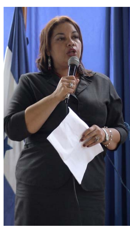
A speech given by a mother Of a graduating student.