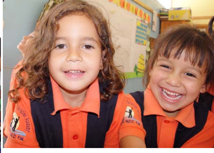
Second grade in class