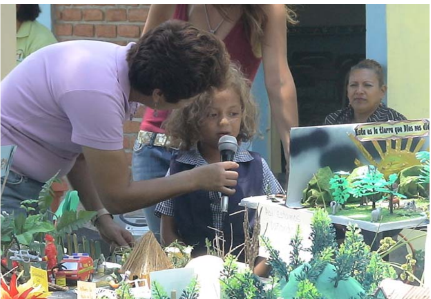
A student presents her project.