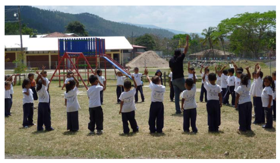
Team games in P.E.