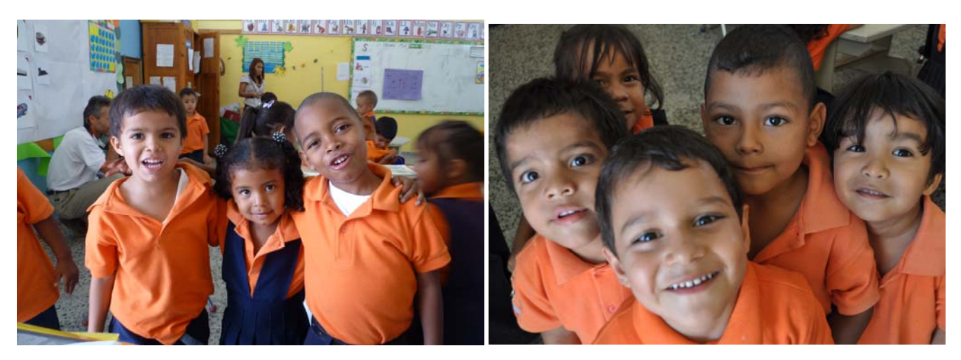
Not camara shy! The students of Preparatoria (Kindergarten) gather round.