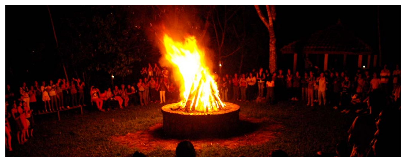
Prayer and worship around the bonfire, a weekend highlight.