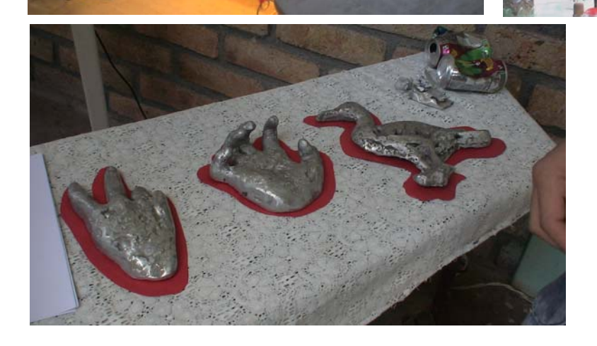
Here are some projects developed by students on the theme of recycling.