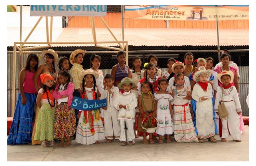
A presentation of Honduran traditional dress in each of the country's departments.