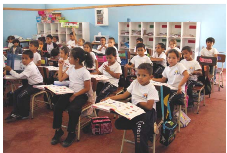
First Graders in Spanish Class