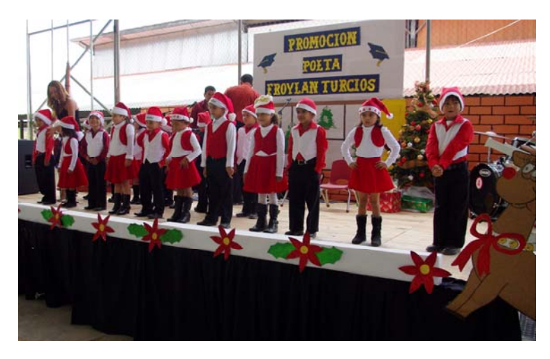
A Christmas Drama