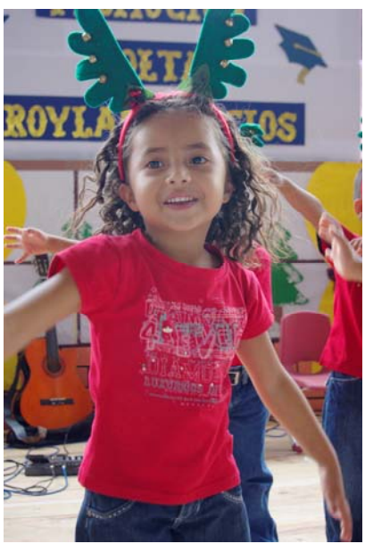
The proud graduates of Kindergarten