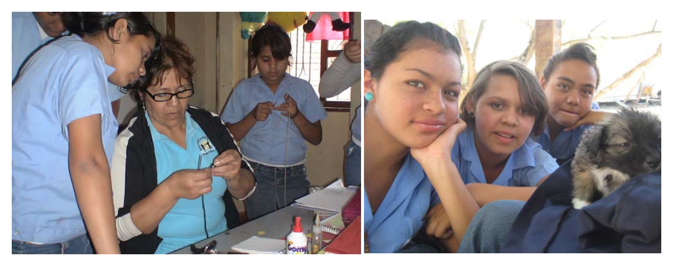
Hand crafts: sewing, jewelry making, etc teach students marketable skills

The computer lab, where every student receives a basic introduction to technology.