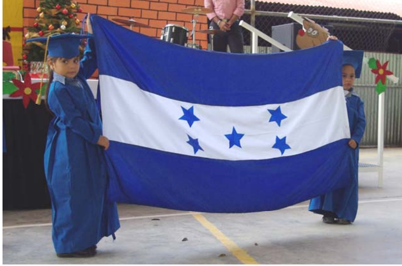
Pledging to the Honduran Flag